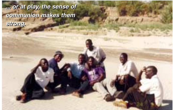
... or at play, the sense of communion makes them strong.