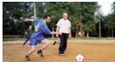
In Ukraine too the seminarians share an enthusiasm for football.