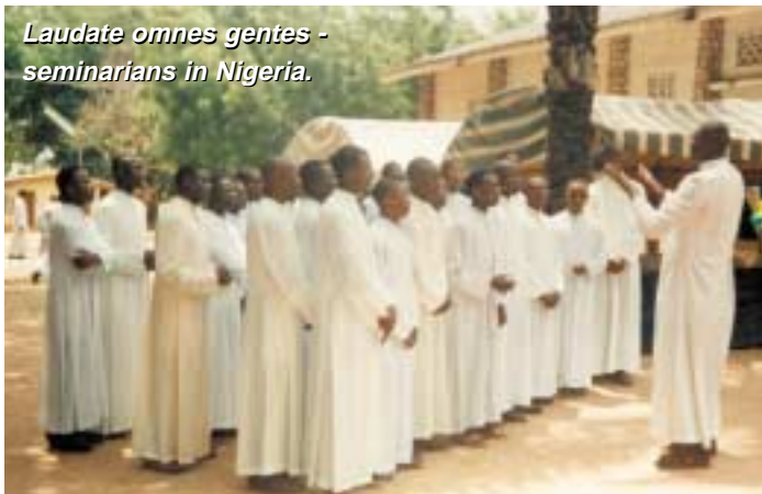
Laudate omnes gentes - seminarians in Nigeria.