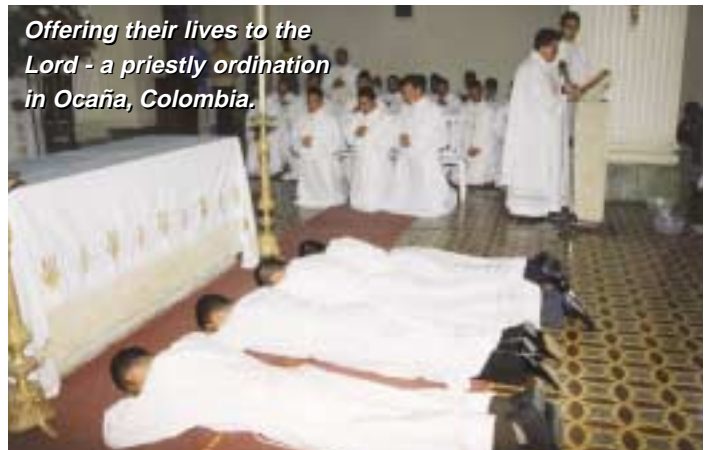
Offering their lives to the Lord - a priestly ordination in Ocaña, Colombia.

We owe to St Thomas Aquinas not only his profound reflections on love, the Trinity and the Cardinal Virtues. This great Doctor of the Church of the 13th century also gave us some wonderful hymns on the Eucharist.