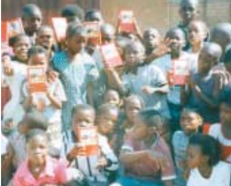
Children and the Bible - two keys to the future. The joyful faces of these school-children in Zambia say it all. Can we not try to make other children happy too?

With Rome's approval, this book too has been published in the millions (4 million copies in 20 languages) proving how great is the thirst for the truth. Requests still pour in from over 60 countries - as do letters of thanks. A missionary writes from Paraguay : “Faced with the many sects, our parents and catechists now have, in the Little Catechism , a sure guide to hand.” Nothing is more sure than the authentic Word of God. Just how quickly and widely we can