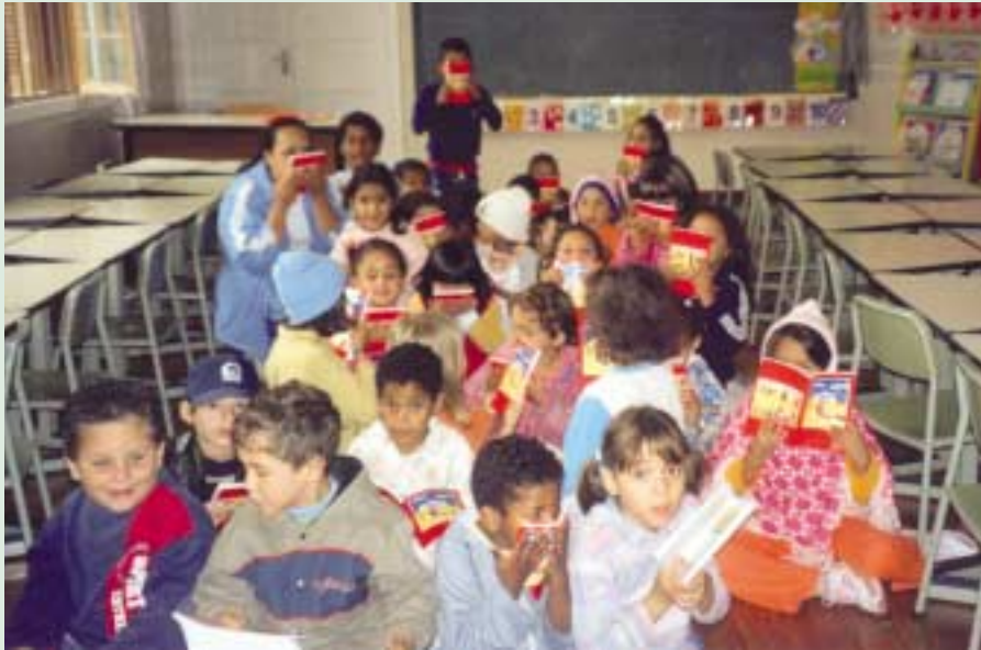
Embracing the Child's Bible - their way of saying 'Thank you'. These children in Campo Limpo, Brazil have been rejected or abandoned by their parents.

“Our Christianity must be so ardent and so radiant - a city built on the hilltop and a light on the lampstand - that others are led to the conviction that we have the truth and the life.”