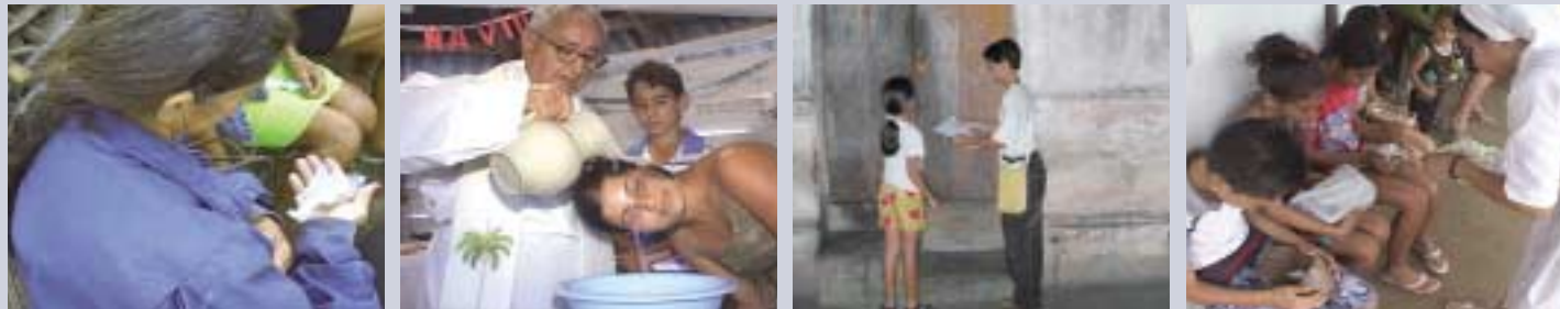
The presence of the Child transforms hearts. In Cuba old and young alike are welcoming Jesus into their homes.

Soon everyone will have heard of them in Cuba . They call them “the Children of the Church”. Aged eight to twelve, they bring Jesus into the homes - a little figure of the Child of Bethlehem.