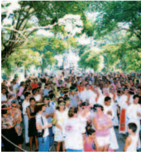
People of God on the move – Procession in Cuba, still without loudspeakers.