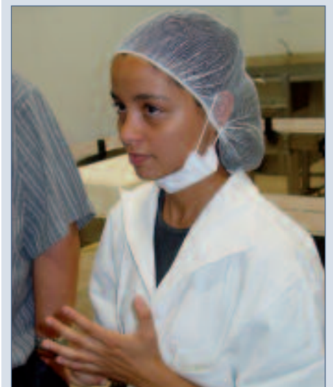
New life through work and prayer. Your generosity has made this possible.

flesh. “To love is to give everything, and to give oneself,” said Saint Teresa of the Child Jesus. That is what has happened here, through work and prayer. In Guaratinguetá the Pope will be looking into faces of love. ●