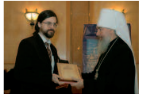
A bridge to the Russian world – Dialogue thanks to Blagovest-Info.

Another unique bridge of understanding is Blagovest-Info . This Russian-language agency for religious information regularly reports on the often-difficult dialogue between Orthodox and Catholic believers. Both Russian and Western newspapers, agencies, radio and TV