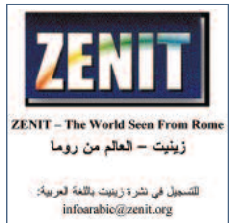
A bridge to the Arab world – The logo on the new Arabic edition of Zenit.

stations make use of this crucial source. You are nurturing it with your generosity. We are hoping to be able to give at least €80,000 to cover the current year’s budget. It is a matter of providing truthful information and so building bridges and “renewing the face of the earth – this earth”, as Pope John Paul II used to say. For we don’t have another one. ●