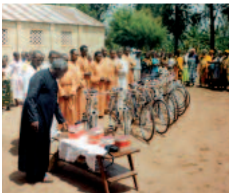
Tanzania, Rulenge – Bibles and bicycles for the catechists.

The Faith in Cuba is deeply rooted, despite decades of communist dictatorship.