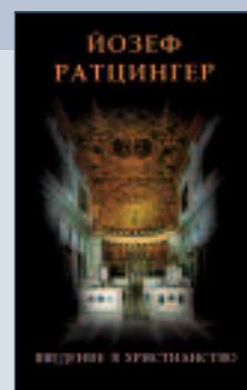
“Introduction to Christianity” in Russian.

representative of the Moscow patriarchate, has written a foreword to it. Another work of reconciliation is the translation of ACN’s Child’s Bible into Arabic. How many children will be able to read it and glimpse salvation! And how many millions of children around the world already know the Child’s Bible of ACN! The life of Christ, his words, his deeds – together they make us all into children of God, both those who read and those who give. And there are many more who are still waiting. ●