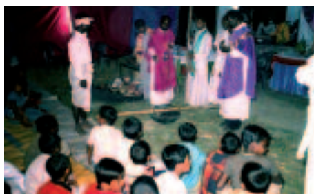
Great expectations – Catechesis in the new diocese of Purnea, India.

But the Word of God also needs silence. It needs the prayer of silence in the monasteries. Saint Edith Stein, Patroness of Europe, said of this silent monastic prayer: “It is our vocation to stand before God on behalf of all.” In Sampor, a small village in Slovakia , nine Benedictine Brothers have chosen to embrace this life. At present they are still living in a tumble-down house. They pray eight hours each day and work in the garden and in the fields. They have a site for their new monastery in Sampor, but no money for the walls that will shelter this silence. We have promised them €40,000 so that they can move in as soon as possible. These nine Brothers will stand before God on our behalf. Their silent prayer is the pure essence of the Gospel. ●