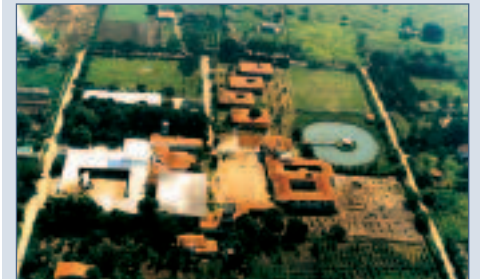
Guaratinguetá, near São Paulo, Brazil. This place of hope began in 1983.

For these young people have come through the hell of drug addiction. They were healed here on the Farms of Hope . It was the Gospel, the love that healed them. In them the Word of God has again become