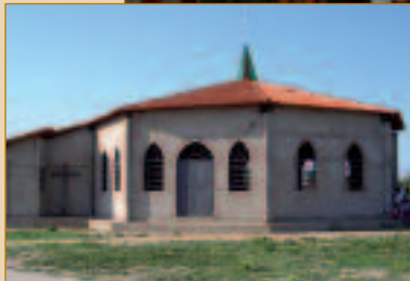
A big "Thank you" (Danke) to ACN (Kirche in Not).