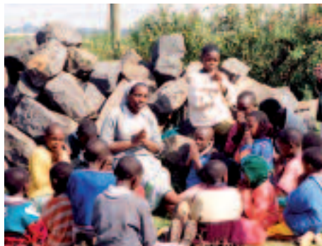
Pope John Paul II: “The family that prays together, stays together.” Whether outdoors or in church, whether in Kenya or Armenia, everywhere, Mary unites us.