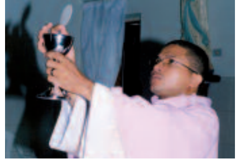
Brazil: The Lord is here. In many dioceses, Christ is their only hope.

Never should we forget that Christ himself came to the Lebanese lands of Tyre and Sidon. On a hill in Sidon there is a statue of the ‘Maria Mantara’ – the Waiting Virgin. She is waiting for the return of her son.