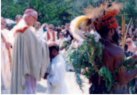
Papua New Guinea: To choose the priesthood is to choose a life of poverty.