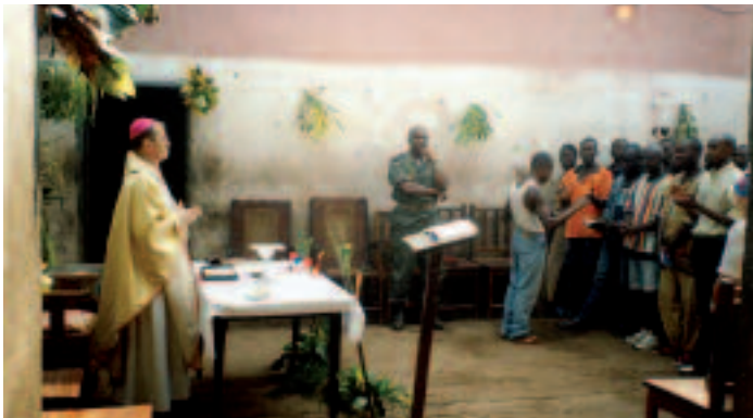
Cameroon: The presence of the Lord makes them all brothers.

Heaven,” he writes. More than that, you are helping the Christians to be witnesses of redemption and peace. Likewise in today’s Iraq , Mass Stipends are often the main source of survival. This year, despite the ongoing conflict, the Archbishop of Mosul has even managed to ordain four seminarians to the diaconate. In Africa, the situation is little different. “You are like a mother to us,” says the rector of the seminary in Boma in the DR Congo , while in Kabale, Uganda , the rector is convinced: “This is the Mystery of the Faith. The Holy Eucharist brings us salvation and the strength of forgiveness.” So said Pope Paul VI in 1965. The Lord is here – and wherever you help with Mass Stipends, his redeeming power bears rich fruit. For at the Mass they are praying for you. ●