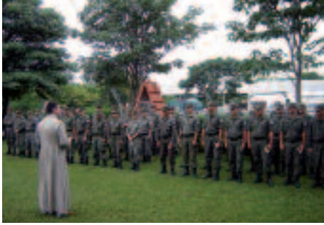
Forming up for prayer: A company in Córdoba, Argentina, praying the Rosary.