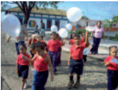
Venezuela, 18 October 2006: Beaming children after praying the Rosary.

Guardini. “It is power, essence, form.” He also adds, “The Rosary consists of holy words.” Let us join in and pray it too. ●