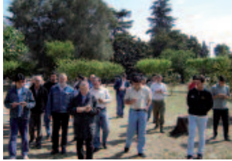
Inner freedom: Retreat day in the presence of Mary for prisoners in Córdoba.