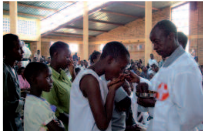
Rwanda: Reconciliation is an essential part of the Eucharist.

In the valley below, a Palestinian refugee camp with a number of mosques stretches into the distance, and close behind it lies a Christian quarter – an island with a few church towers. It could almost be a picture of peaceful co-existence. But the Maronite Archbishop of Tyre tells us: “The Israelis and the Arabs have been fighting each other here since 1948.” He adds: “We Christians would like to be witnesses of reconciliation and peace.” The war has sapped the resources of his diocese. But the Christians still pray, and whenever they celebrate Holy Mass they know the Lord is here. “The Mass Stipends you send are like a blessing from