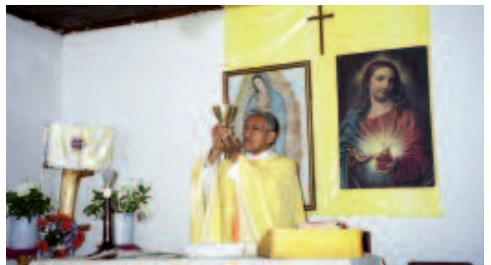
Guatemala: In the Sacrifice lies salvation – for the priest as well.