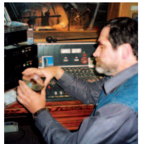
Ready to go with the Gospel. Making final checks at Radio Sofia, Moscow.