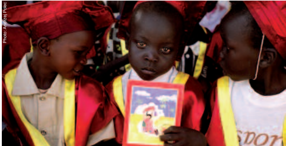
School of life. In Sudan too the Child's Bible is pattern and example.

In the beginning was the Word. And the Word became Scripture and worked among us... It still does so today. So too, the little version of the Holy Scriptures, our Child's Bible , works wonders of grace in millions of hearts and souls.