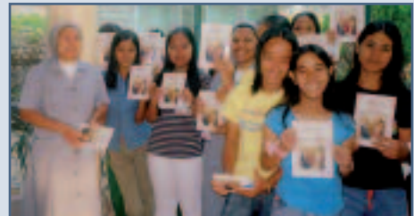
A catechism to be learned and lived. A religion class in the Philippines.

letters are pouring in from your grateful brothers and sisters. They testify how your generosity is strengthening the unity of the Church worldwide. ●