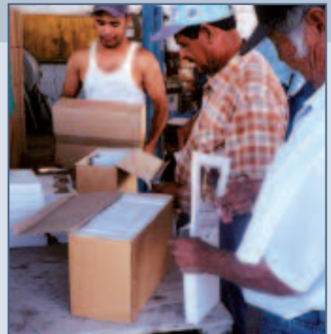
Truth comes in small parcels... Packing up ACN's Little Catechism for Cuba.