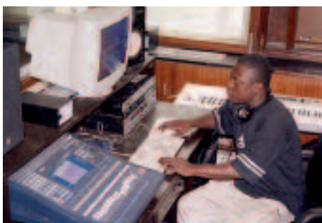
Nigeria. Without radio, much of Africa would not hear the Good News.

Christian education is likewise a goal of Radio Voskresinnya in Lviv, Ukraine .