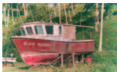
Papua New Guinea. The Black Madonna could do with a total overhaul...