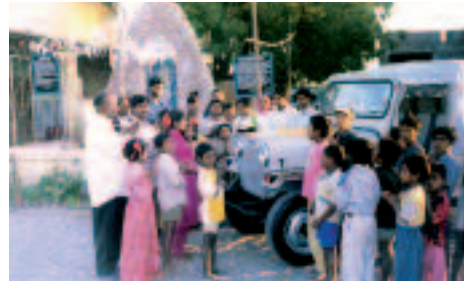
India. Rejoicing at the arrival of their priest in his new car.