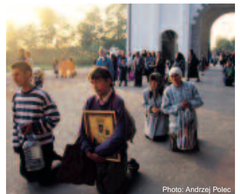
Ukraine. Zaryvnytsia – a place of reconciliation for Catholics and Orthodox.