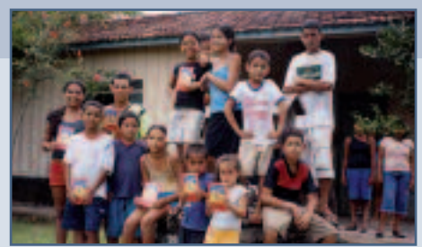
Brazil – a young country, where Bibles are needed