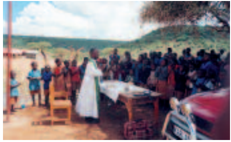
Kenya. Holy Mass outside a primary school, thanks to the Jeep.