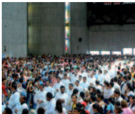
Venezuela seeks Mary's protection. Processing into the Basilica of Coromoto.