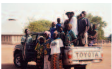
Chad. A car for the sisters always means a car for others too.