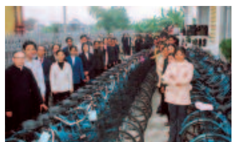
Vietnam. Legions for the Church? Legions of bicycles, anyway.

He's certainly found his bearings in life, or he wouldn't have found his way to the priesthood.