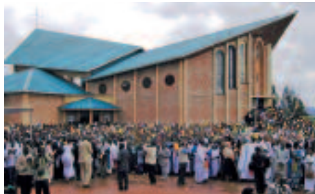
Kibeho's Jubilee year. Gathering for the procession in front of the shrine.