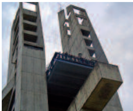
Imposing towers mark the way to the shrine of Coromoto in Venezuela.

the gulag camps. But people did pray, even in Russia. And still in Soviet times, Father Werenfried managed to achieve a TV link-up – a bridge of prayer – between Fatima and Moscow. Now the four Catholic bishops in Russia wish to make a pilgrimage to Fatima, together with 90 of their flock. But they cannot raise the €25,000 they need for this pilgrimage. Help us to build this bridge once more, not across the airwaves this time, but in hearts of flesh and blood. The Mother of the Word will rejoice. For prayer is the source of conversion – and of reconciliation with God. ●