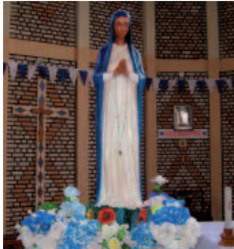
Every suffering becomes a "flower-filled meadow". Our Lady of Kibeho