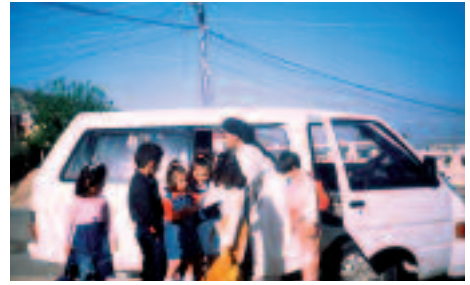
Iraq. Travelling in Sister's minibus is where they feel safe.