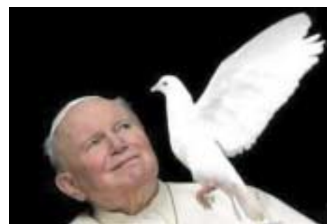
Pope John Paul II. Just a few weeks before his death, and already too weak to speak, he wished to send the people on St Peter's Square a dove as a sign of peace and love. But it was too cold for the dove, and it turned rapidly back - to the Vicar of Christ, who in his sufferings better embodied the love of Christ for mankind than any symbol.